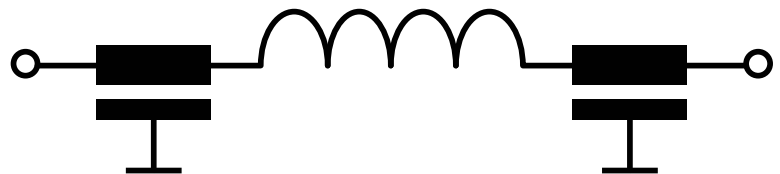
Typical Electrical Schematic