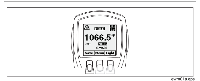
Figure 3. Menu Navigation