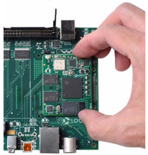
Figure 2.1 – Align SOM-M2 over eXperimenter Baseboard

2. Press straight down on the SOM-M2, applying even pressure over the eXperimenter baseboard BTB socket connectors. See Figure 2.2.