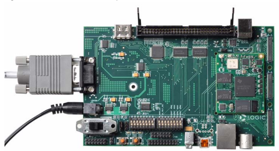
Figure 2.5 - Connect Power to eXperimenter Baseboard

З. Plug the power adapter into an electrical outlet and the 5V line output connector into the power-in connector on the eXperimenter baseboard.