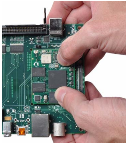
Figure 2.2 - Connect SOM-M2 to eXperimenter Baseboard

2. Press straight down on the SOM-M2, applying even pressure over the eXperimenter baseboard BTB socket connectors. See Figure 2.2.