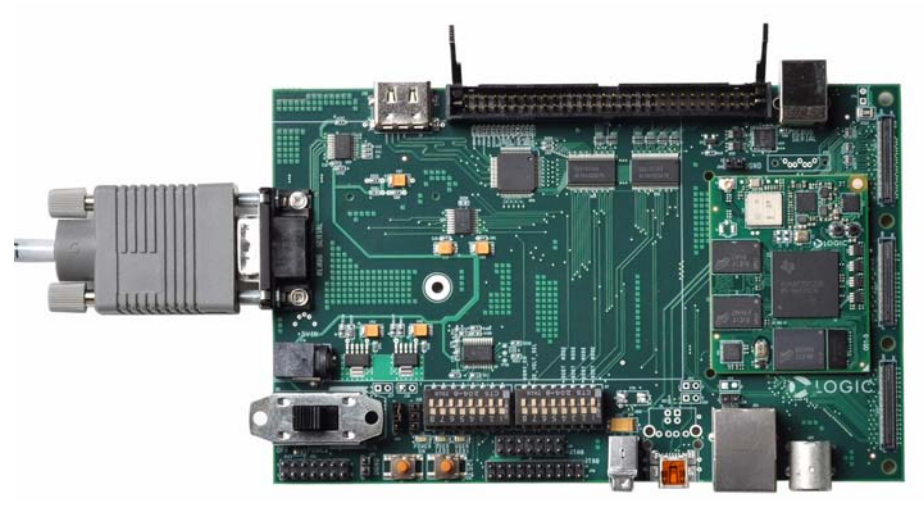
Figure 2.3 - Connect Null-Modem Serial Cable to eXperimenter Baseboard

2. Connect the regulated 5V power supply to the appropriate power adapter for the geographic region in which you are using the development kit.