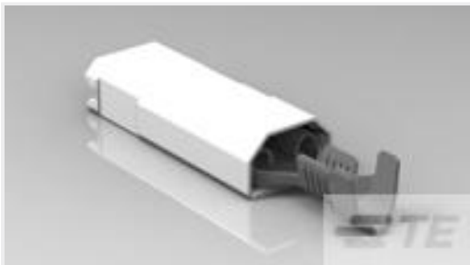
TE Part #521011-2 ULTRA-POD 250 ASSY REC 18-14 AWG TPBR