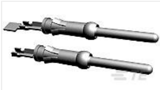
TE Part #66103-4 III+ PIN,24-20,30AU/FL,LP