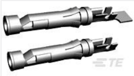
TE Part #66105-4 III+ SKT,24-20,30AU/FL,LP

Product Drawings WIRE CUTTER TOOLESS M/JACK