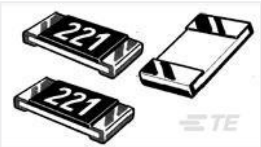
TE Part #2176232-3 3522 160K 1% 3W