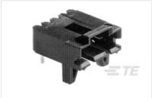
TE Part #6-103672-1 12 MTE HDR SRRA LATCH W/HLDWN