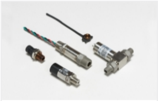
Industrial Pressure Transducers(42)