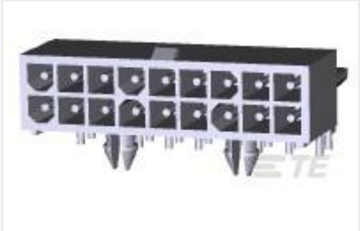
TE Part #1-794105-0 18P MINI UMNL R/A HDR ASSY SN