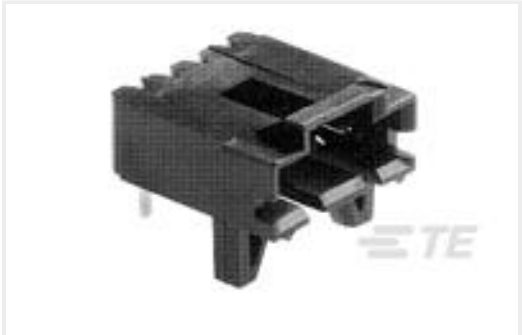
TE Part #5-103672-1 02 MTE HDR SRRA LATCH W/HLDWN