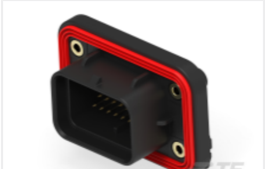
TE Part #2384723-3 34POS,PIN DIA 1.0,HDR ASSY,90DEG