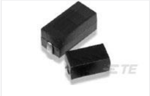
TE Part #6-1879021-1 SMW3 33R 5%