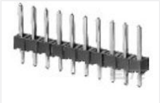
TE Part #5-146281-3 03 MODII HDR SRST B/A LF