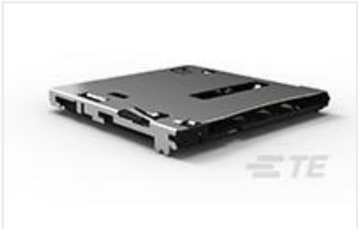
TE Part #2174803-2 PUSH-PUSH MICRO SIM CONNECTOR