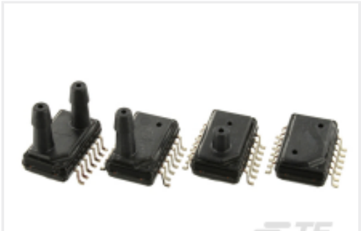
TE Part #5525DSO-DB001DS 1PSID DIGITAL PRESSURE SENSOR