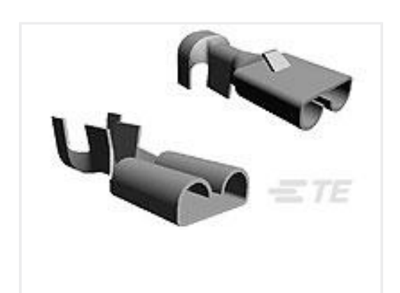
TE Part #280919-4 FF 187 REC 0.5-1.5MM2 TPPB